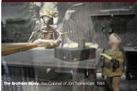
The Brothers Quay, The Cabinet of Jan Svankmajer , 1984